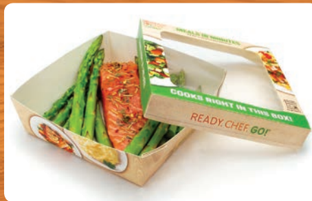
RCG-MWMD + RCG-MWMDLD