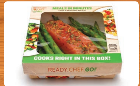
RCG-MWSM + RCG-MWSMLD