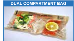
DUAL COMPARTMENT BAG