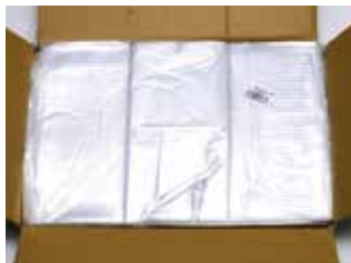
The Elkay Way

Elkay packaging is second-to-none! Elkay bags are packaged in clearly labeled and bar-coded cartons to help your operation run more efficiently. Most of Elkay's case-packed bags 15 inches wide and under are packaged in individually-labeled inner dispenser packs for convenience, protection and to reduce waste.