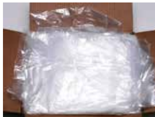
A Leading Competitor

ASK YOURSELF: Which of these "identical" products would your customer rather package their products in?