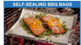
SELF-SEALING BBQ BAGS