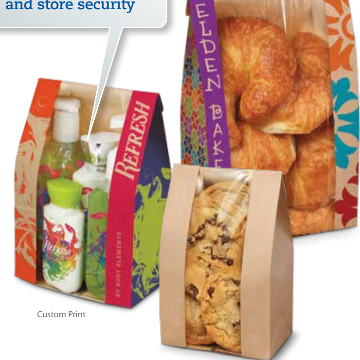
Stock: Natural Kraft