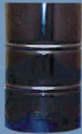
55 Gallon Cans