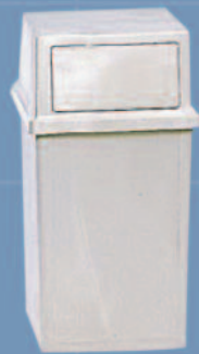
40-50 Gallon Cans