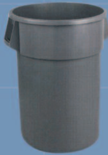
60 Gallon Cans