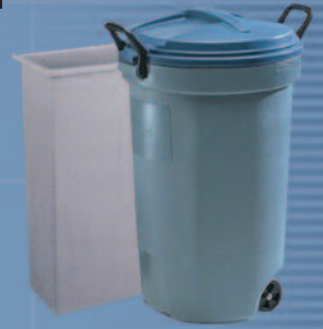
33 Gallon Cans