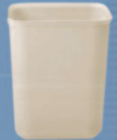
Under 20 Gallon Cans