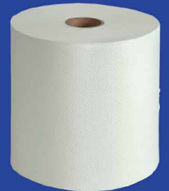
CENTERPULL TOWEL WHITE