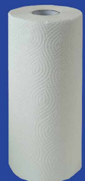
KITCHEN ROLL TOWEL WHITE