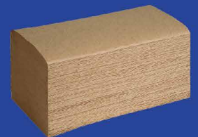
CENTERFOLD NAPKIN NATURAL