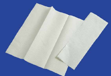
MULTIFOLD TOWEL WHITE