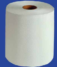
HARDWOUND TOWEL WHITE