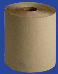
HARDWOUND TOWEL NATURAL