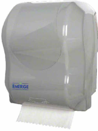
Automatic HANDS FREE HARDWOUND TOWEL DISPENSER D1473