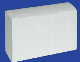
MULTIFOLD TOWEL WHITE