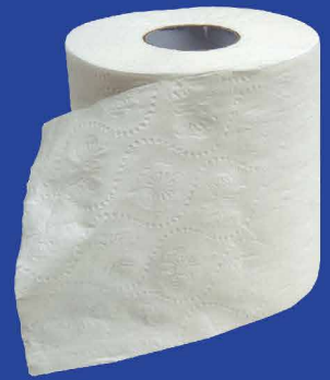
STANDARD ROLL TISSUE