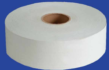
JUMBO ROLL TISSUE