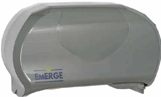
Microcore Tissue HORIZONTAL 2-ROLL DISPENSER D3675