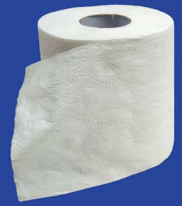
STANDARD ROLL TISSUE