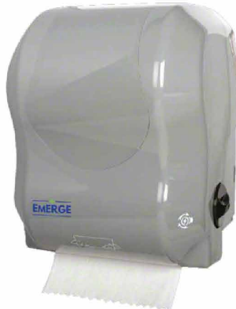
Mechanical HANDS FREE HARDWOUND TOWEL DISPENSER D7473