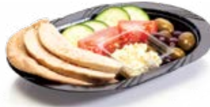
21972 / Portion Cup - 21821 pg.6