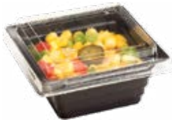
21935 / Lid - 29332