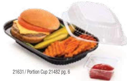
21631 / Portion Cup 21482 pg. 6