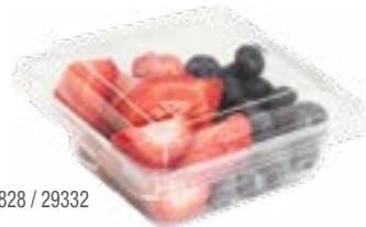
21828 / 29332