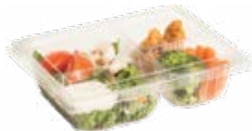
Tray - 82723 / Lid - 82725

Entrée and meal trays are ideal for your larger reimbursable meals, vending machines and complete meal solutions. Suitable for hot and cold foods. Check with your local recycling facility to ensure these containers will be accepted.