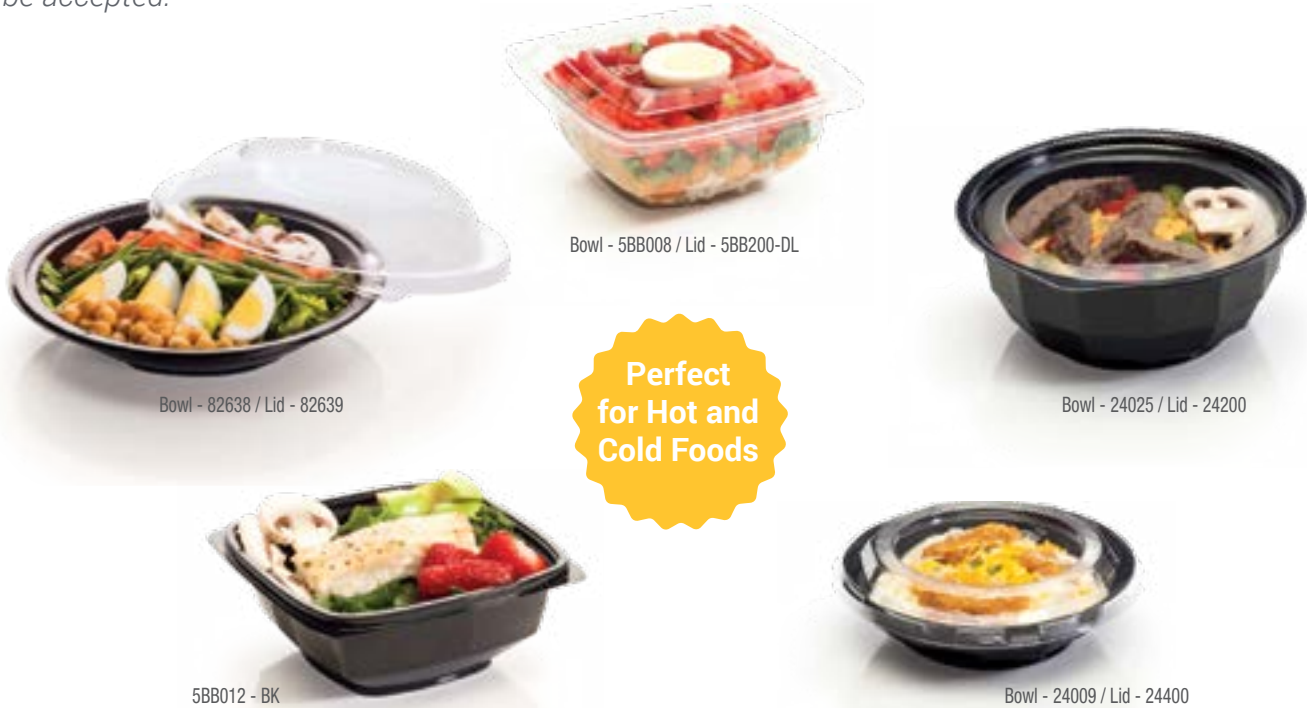
Bowl - 82638 / Lid - 82639

WNA™ Atrium™ Bowls are stylish options that offer a retail look which enhances presentation and visibility. PETE suitable for cold food only. Check with your local recycling facility to ensure these containers will be accepted.